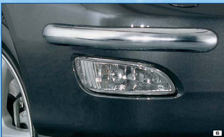
6 Styling front bumper protector Stoßfängerschutz vorne Stainless steel / Edelstahl 180 4081