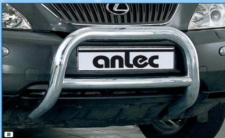
2 Brushguard Bully 76 mm Frontschutzbügel Bully 76 mm Stainless steel / Edeltahl 180 4211