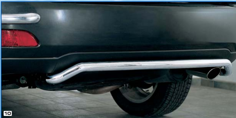
10 Rear bumper shaped Heckstoßstange gebogen Stainless steel / Edelstahl 180 4037