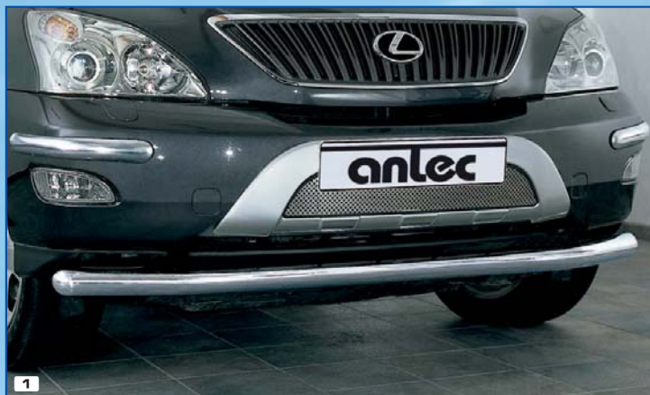
1 Spoiler protection straight zaštitni cev za prednji spojler (pravim) Stainless steel / Edeltahl 180 4116