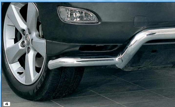
4 Spoiler protection edge (mountable with 180 4117) Spoilerschutzecken (montierbar mit 180 4117) Stainless steel / Edeltahl 180 4115