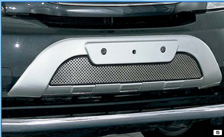
5 Synthetic Frontguard plasticna prednja zaštita PU/plastika 180 4001