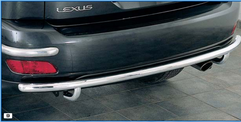
9 Rear bumper long Heckstoßstange lang Stainless steel / Edelstahl 180 4038