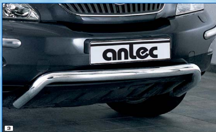
3 Spoiler protection shaped Spoilerschutzrohr gebogen Stainless steel / Edeltahl 180 4117