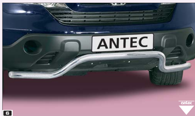
6 EU-spoiler protection pipe 51mm cranked Tubo protezione spoiler curvato a gomiti UE 51mm Stainless steel / Acciaio legato 11V 4017