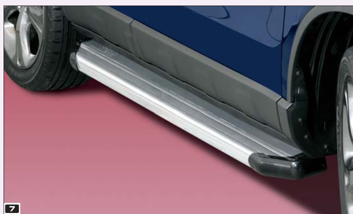
7 Side step 3 Predellino Step 3 Aluminium / Aluminium 11V 4071