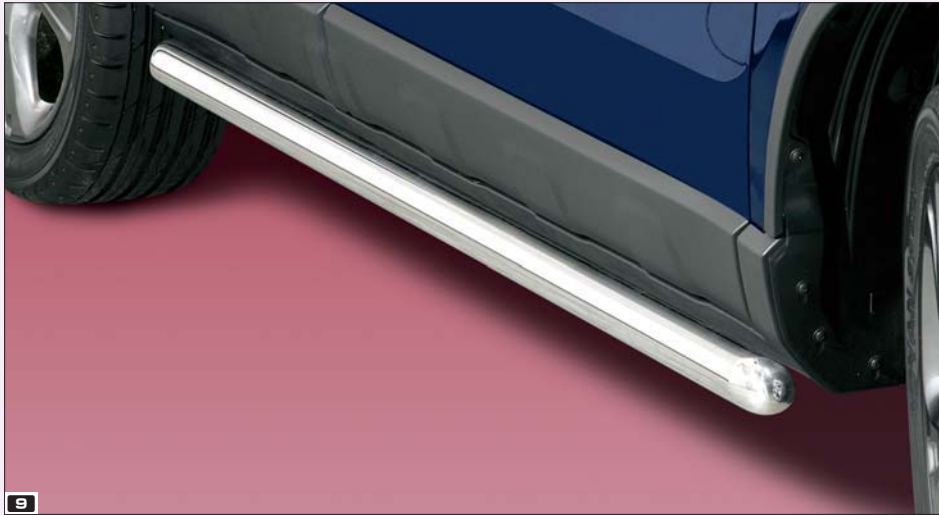
9 Side bar 60mm straight Tubo protezione fianco (diritto) 60 mm Stainless steel / Acciaio legato