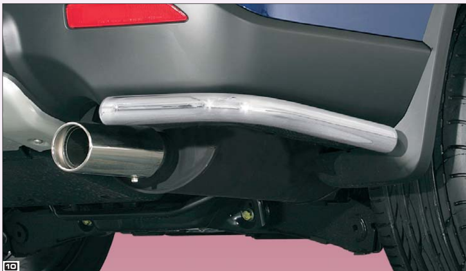
10 Rear bumper protection 42mm single pipe (also mountable with tow-bar) Paraurti angolare posteriore tubo singolo (auch montierbar mit Anhängerkupplung) Stainless steel / Acciaio legato