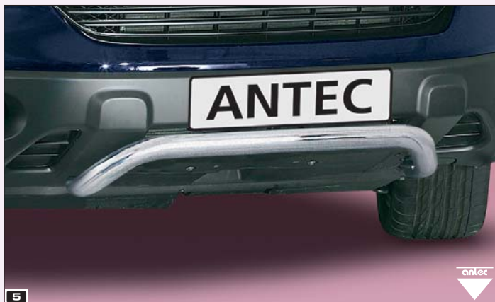
5 EU-spoiler protection pipe 60mm (middle) Tubo protezione spoiler, piegato UE 60mm (Mitte) Stainless steel / Acciaio legato 11V 4016